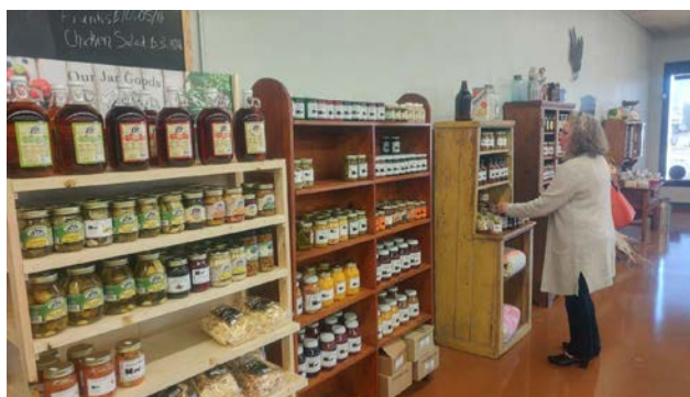
Valley Quality Meats